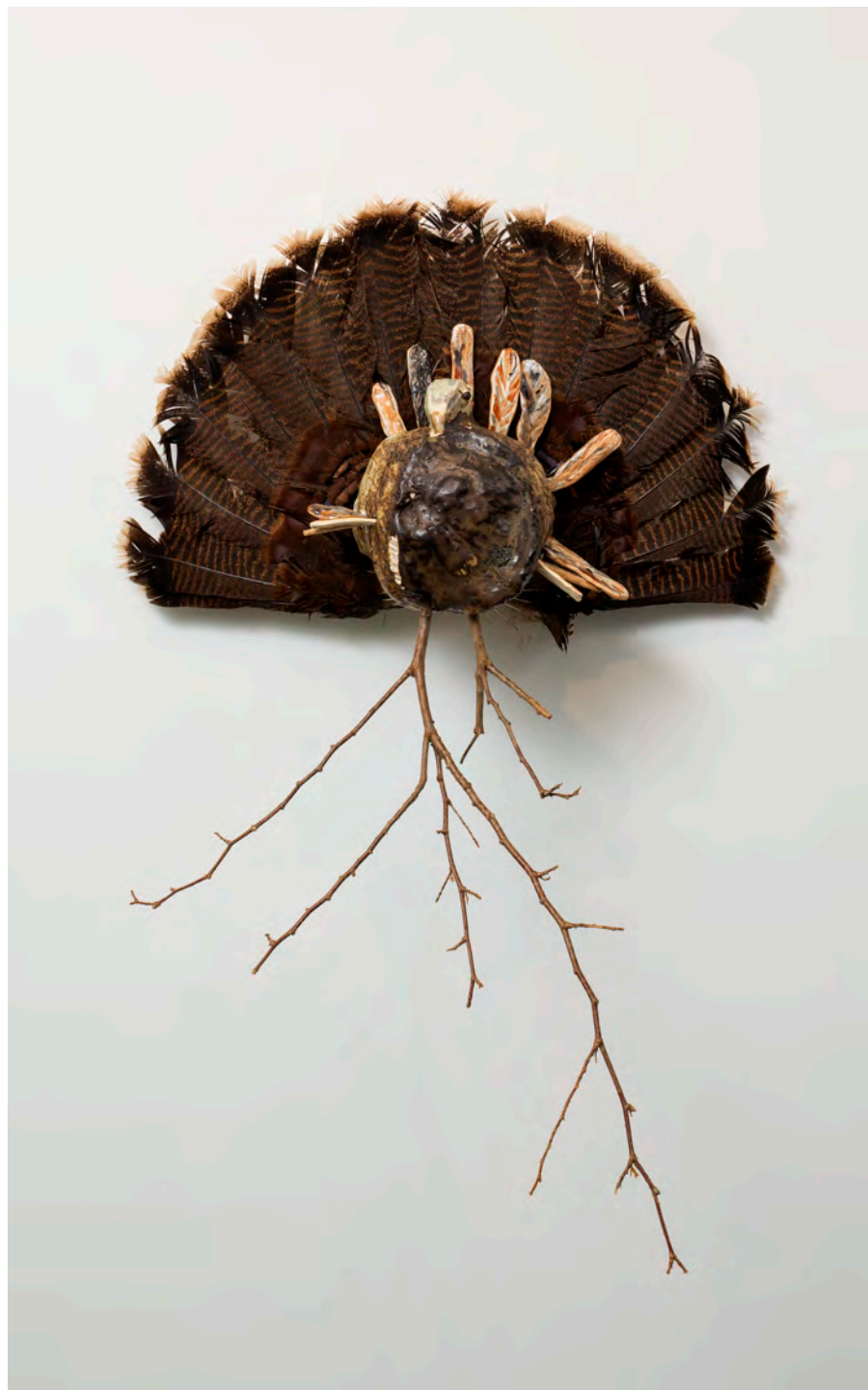
Turkey, 2023. Stoneware, feathers, juniper sticks, 25 x 10 x 23 inches.