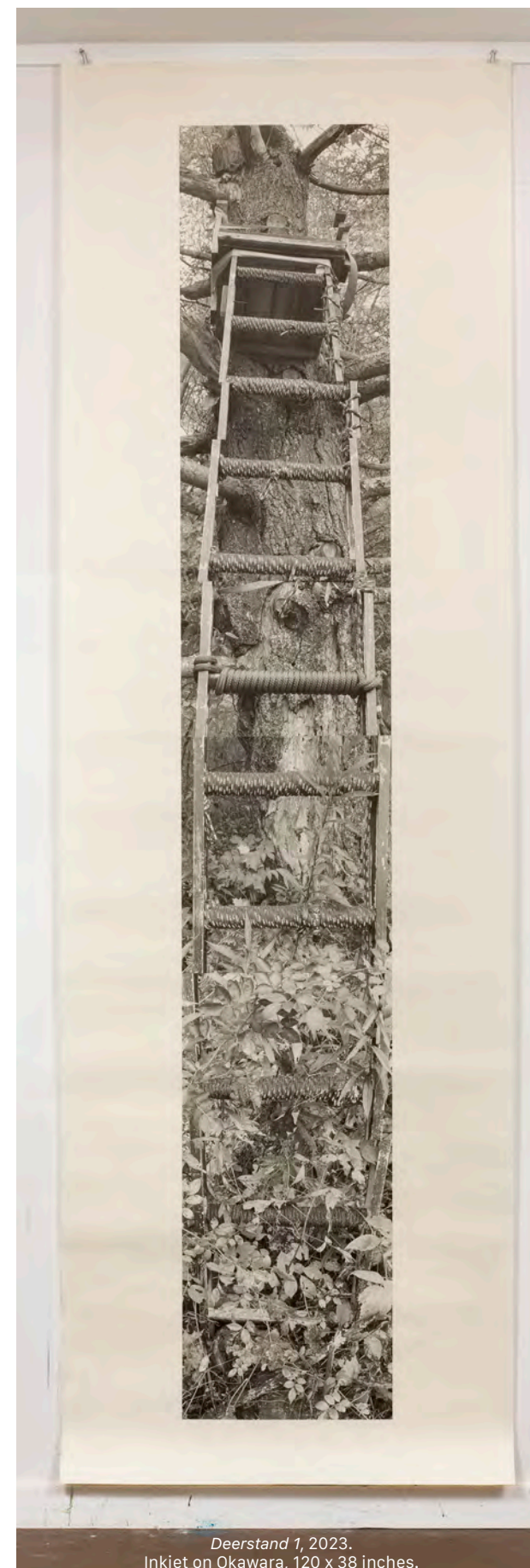
Deerstand 1, 2023. Inkjet on Okawara, 120 x 38 inches.