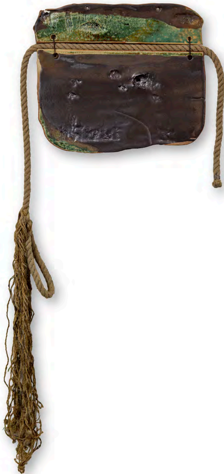
Lost at Sea, 2021. Stoneware, rope. 37 x 18 inches.