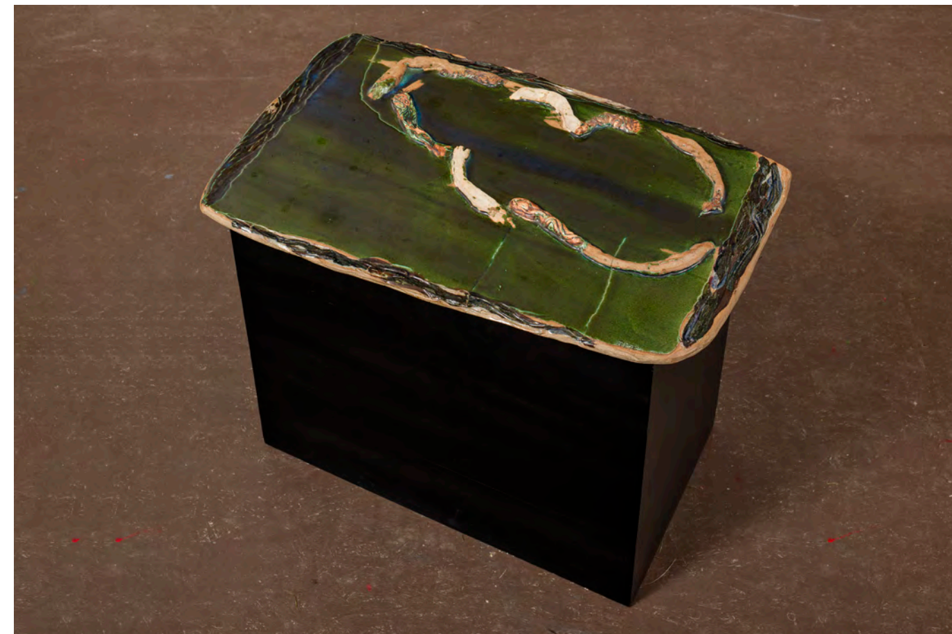
Dance, floating, after Matisse, 2023. Stoneware, porcelain, 32 x 20 x 2 inches.