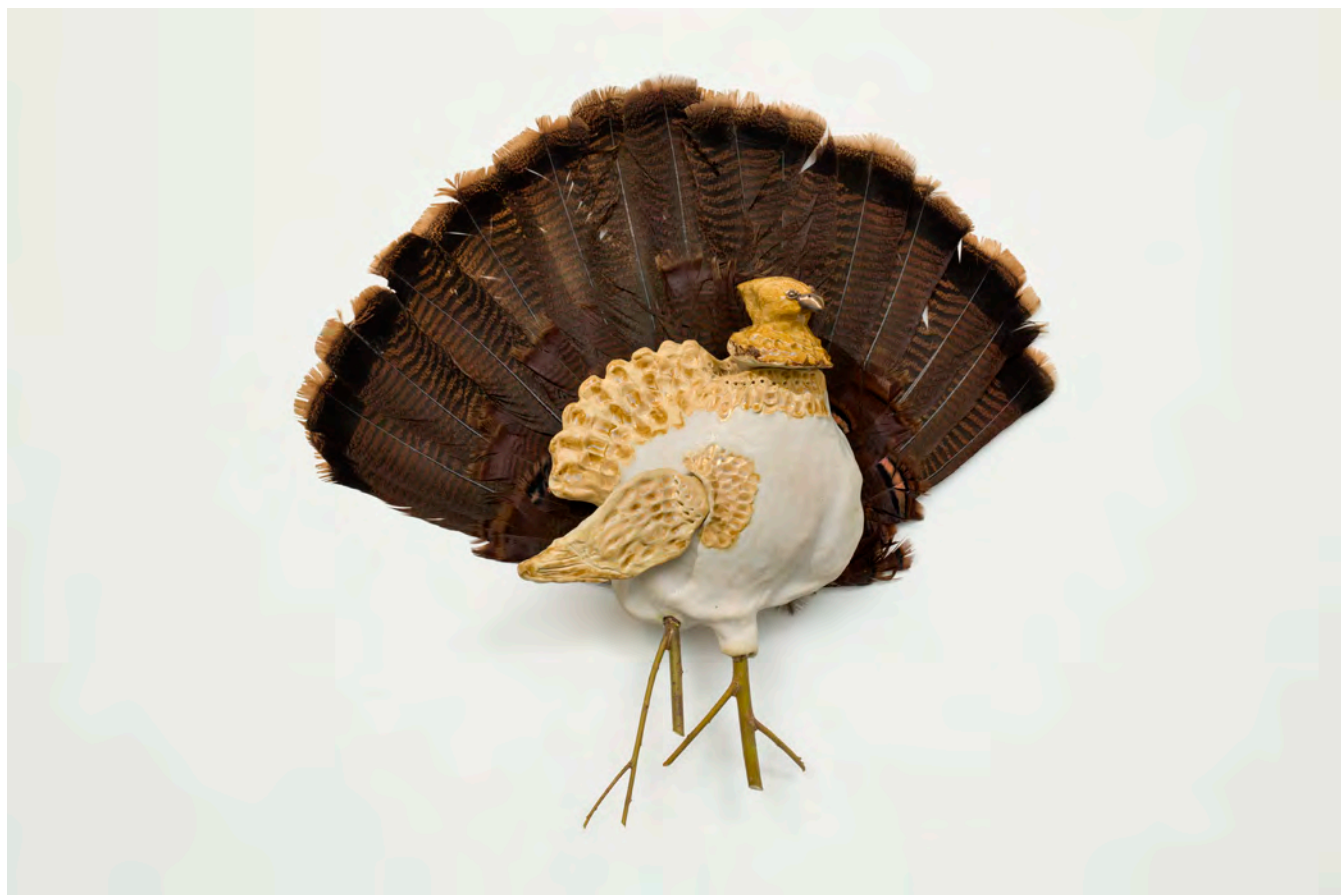
Grouse, 2023. Stoneware, feathers, willow sticks, 21 x 24 x 4 inches.