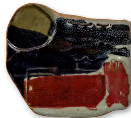
Taps November 8, 2020. Stoneware, 10 x 11 x 1/4 inches.