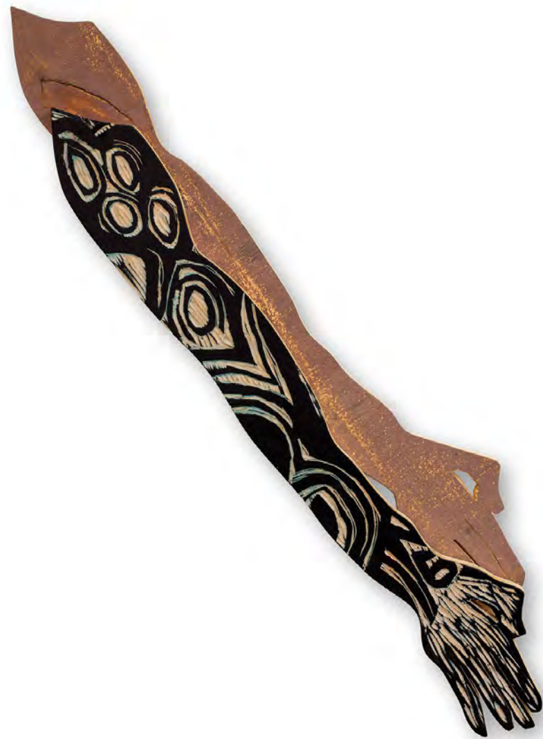
Tattoo Arms, 2020. Carved and inked pine, 38 x 7 x 1 1/2 inches.