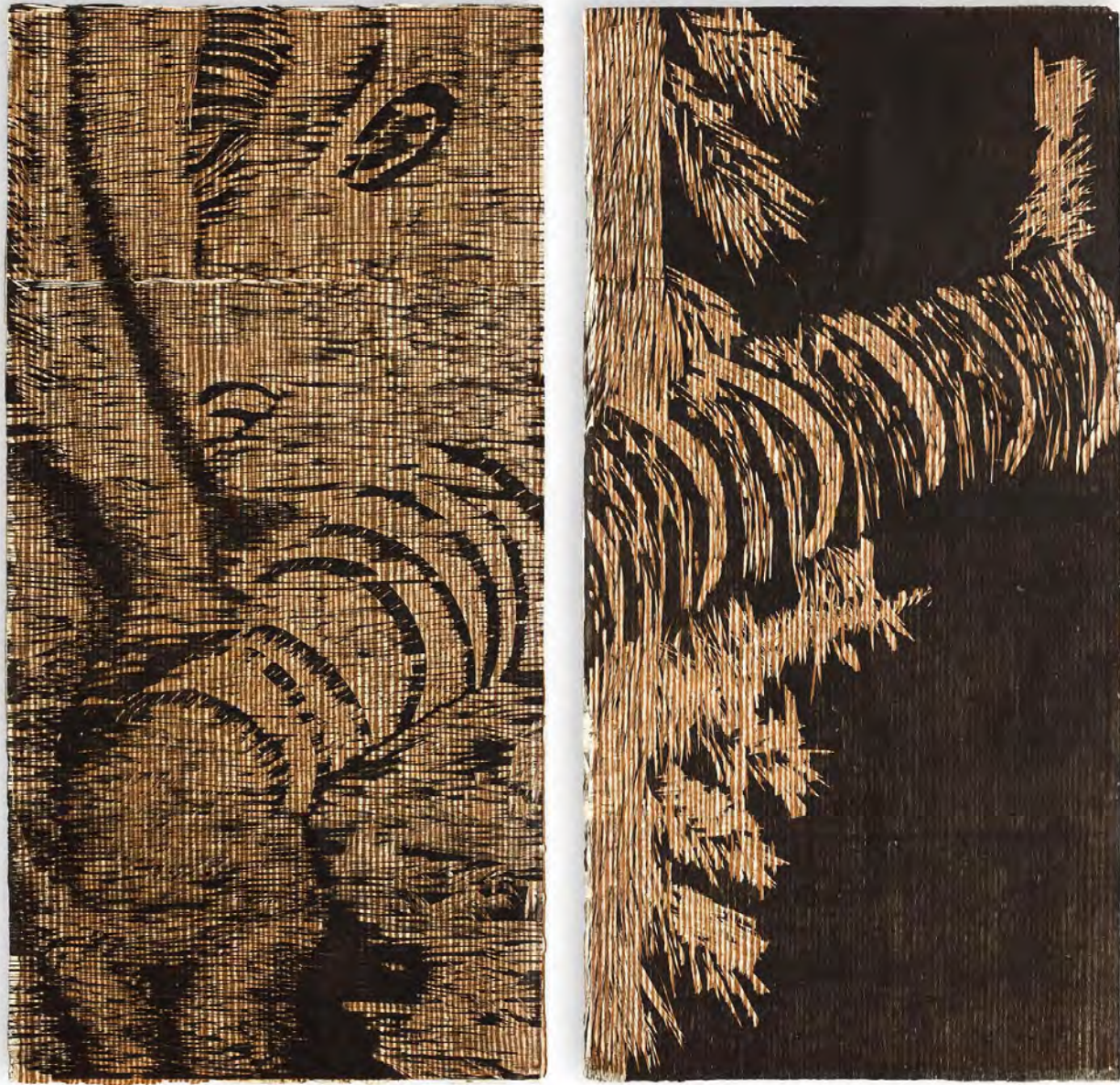
Protection 38 and 39, 1989. Two woodcut reductions on handmade striped Japanese paper, 48 x 24 inches each.