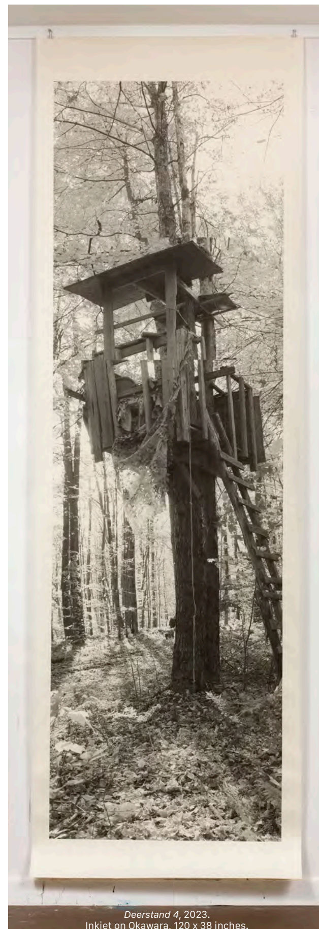
Deerstand 4, 2023. Inkjet on Okawara, 120 x 38 inches.