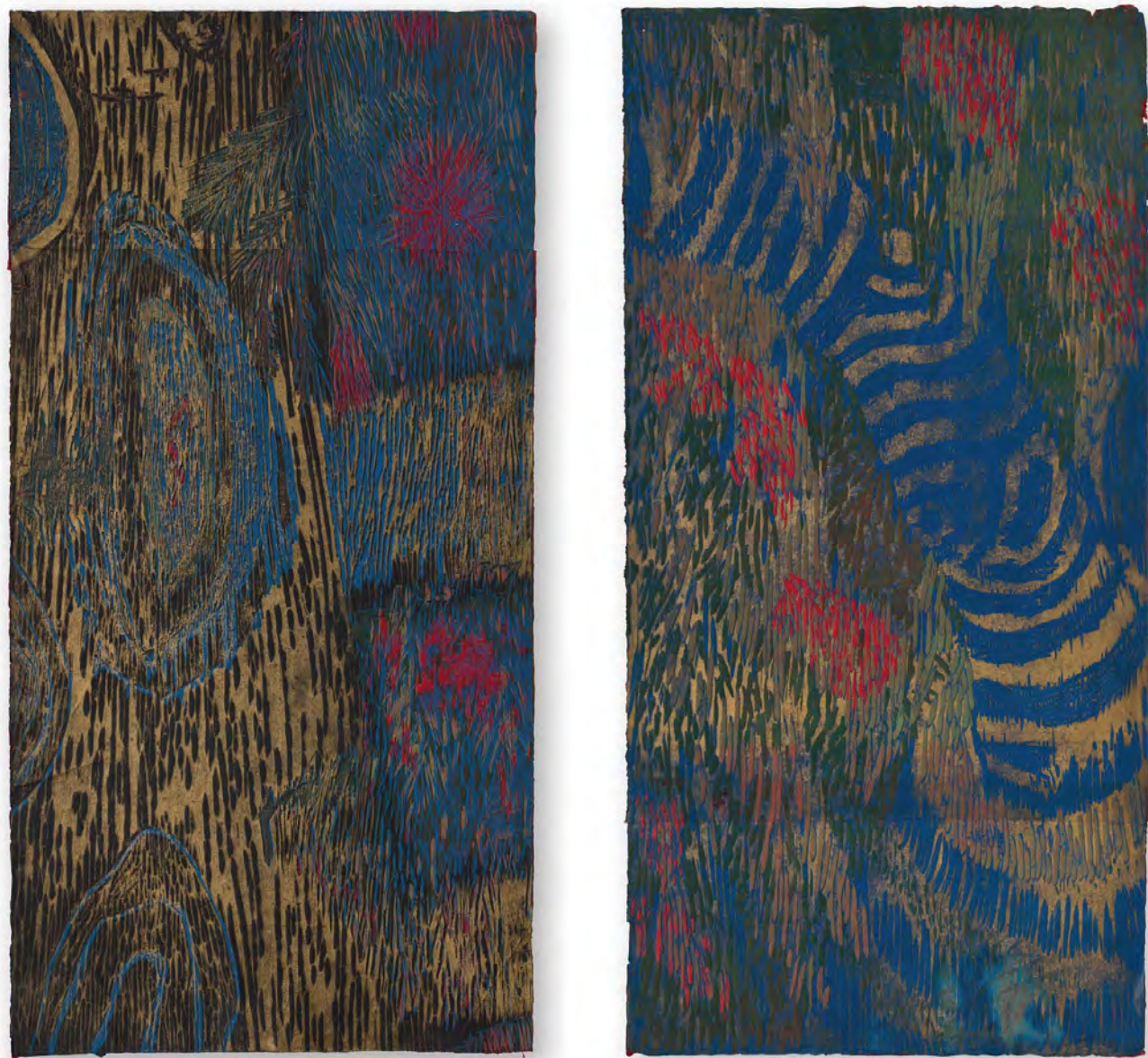
Protection 21 and 32, 1989. Two woodcut reductions on red Japanese paper, 54 1/4 x 30 1/4 inches each.