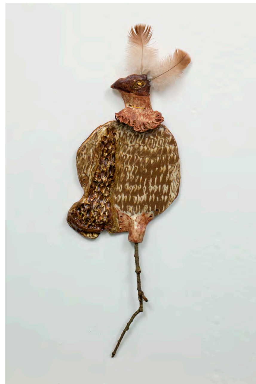
Prairie Chicken, 2023. Stoneware, feathers, stick, 17 x 7 x 1 1/2 inches.