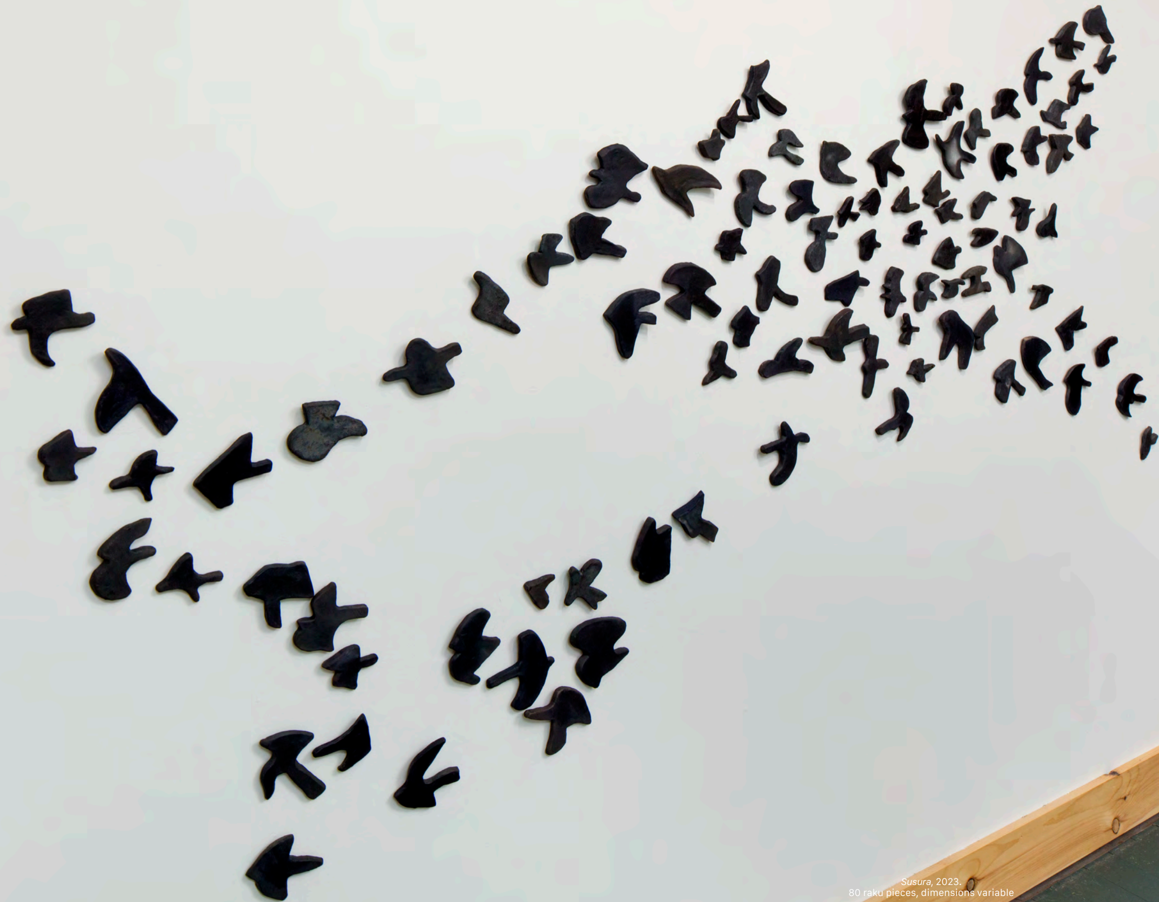
Susura , 2023. 80 raku pieces, dimensions variable