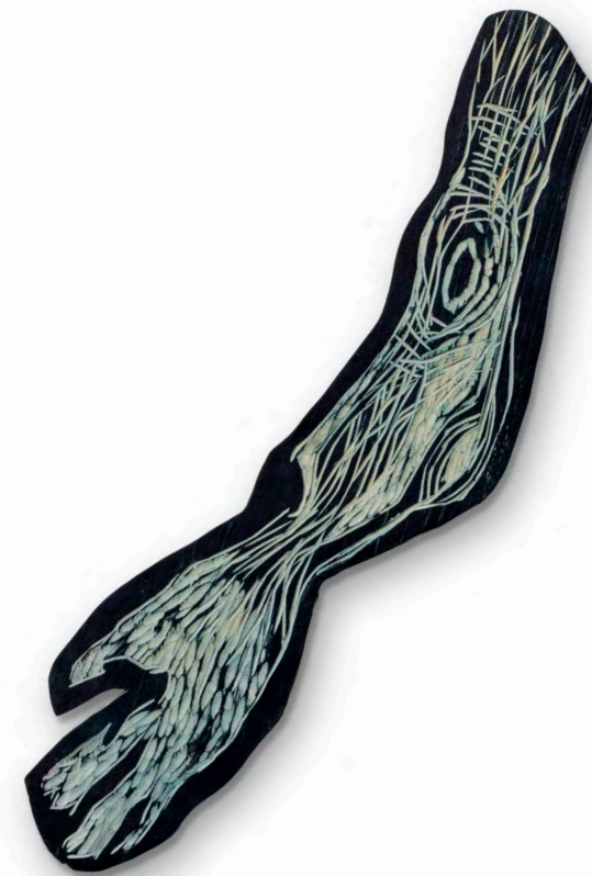
Tattoo Arm 3, 2020. Carved and inked pine, 27 1/2 x 9 1/2 x 3/4 inches.