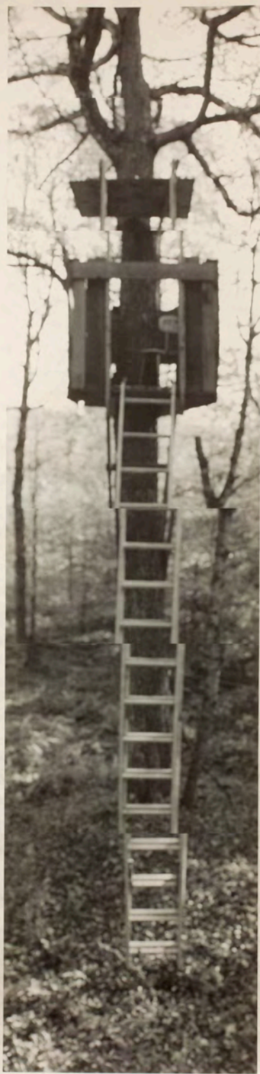
Deerstand 2, 2023. Inkjet on Okawara, 120 x 38 inches.